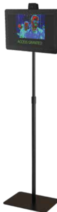
TTS panel shown with optional APS-1 pole stand