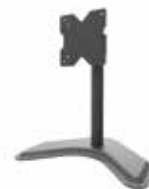
DTM-2 desktop mount